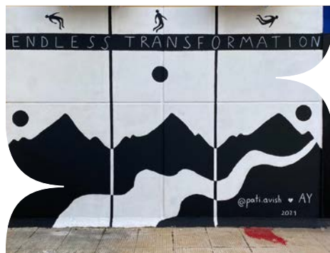
Artwork: ©Pati Avish