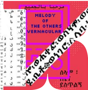
Artwork: ©MELODY of the OTHERS VERNacular