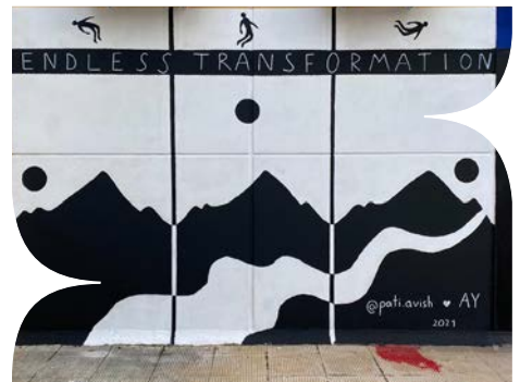
Artwork: ©Pati Avish