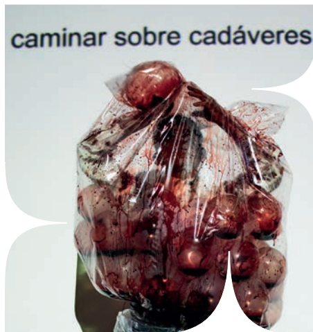
Nadia Granados.

21:40 to 22:00 – Sculpture Garden Nadia Granados: Caminar, cadáveres, genocidio. Performance intervention.