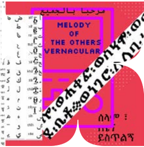
Artwork: ©MELODY of the OTHERS VERNacular