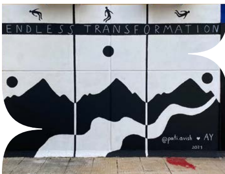
Artwork: ©Pati Avish