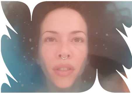
Majla Zeneli.

13:00 to 15:00 – Sculpture Garden Silent University in Austria, WIESE - Wie Es Ist and Versatorium: Translation: Të polli gjeli. (Dir wurde vom Hahn gekalbt). Workshop on translation.