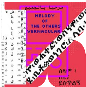
Artwork: ©MELODY of the OTHERS VERNacular