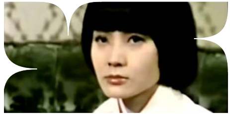
Mai Ling.

17:30 to 18:00 – Blickle Kino Mai Ling Speaks #7 with Guests.