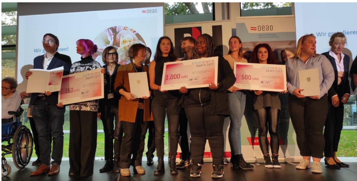
Winners of the "Memories and Imaginaries" Citizen Science Award 2022, at Young Science Congress, 13/10/2022.