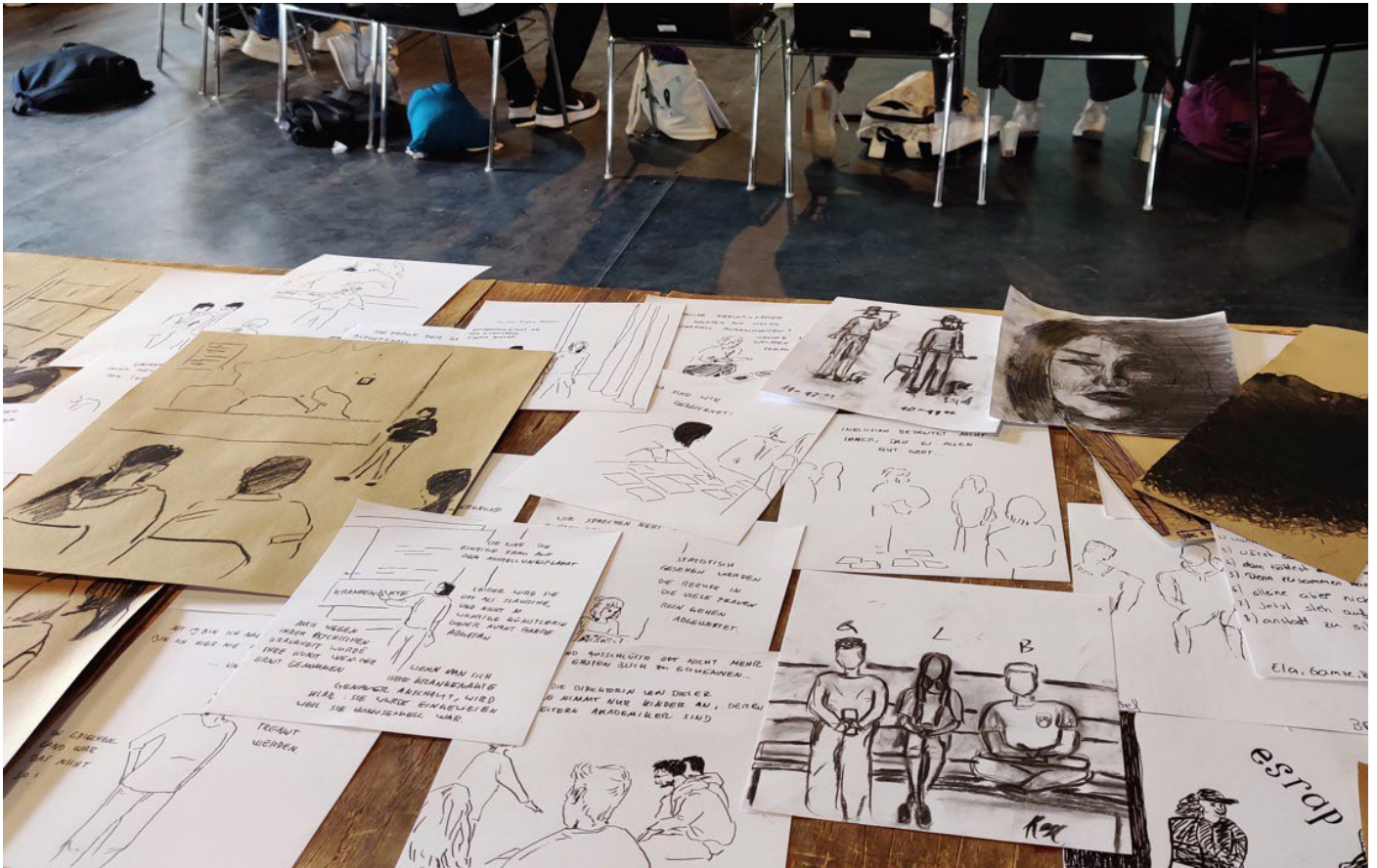
Graphic recordings from memory-lab at Academy of Fine Arts Vienna, May 2022