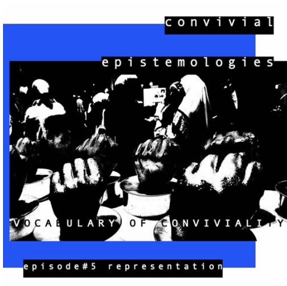
Podcast series "Vocabulary of Conviviality" Episode #5: Representation

Episode #5: Representation is on Muslim*Contemporary, a multidisciplinary, participatory and dialogical festival that aims to reflect on the importance of Muslim communities' participation in society and creates spaces where important social discourses can be reflected and negotiated through representation.