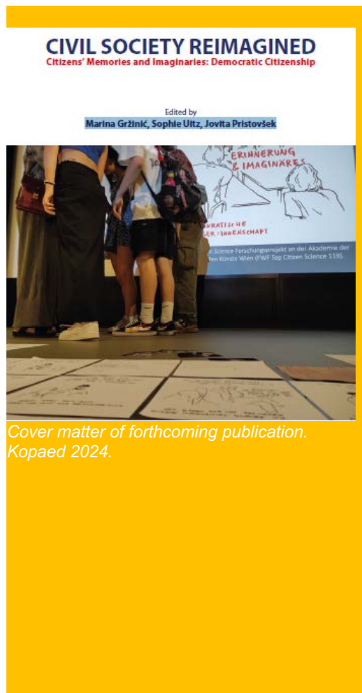
Cover matter of forthcoming publication. Kopaed 2024.

Forthcoming edited volume (2024) FWF TCS 119